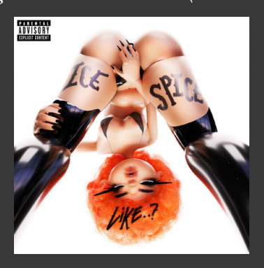
Bubblegum by Biig Piig

TLDR: TikTok's people's princess, Ice Spice, does it again. Listen to 'Munch (Feelin' U)'